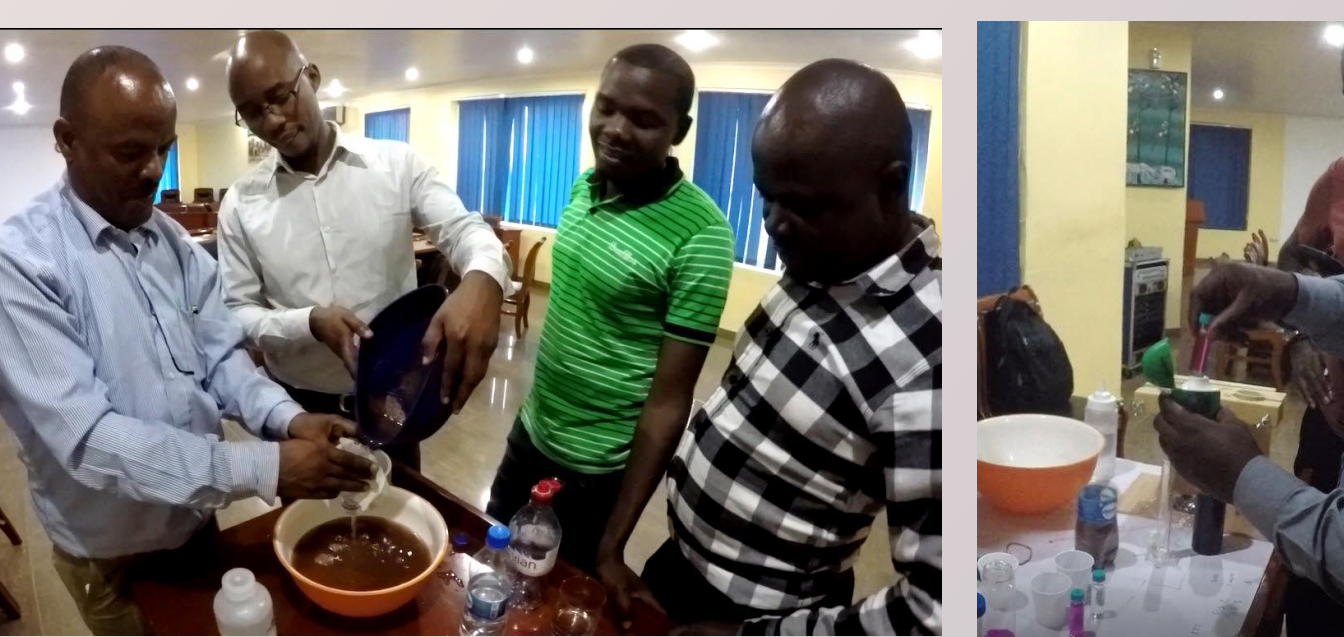
Practicing the aggregate stability and active carbon tests at a regional training