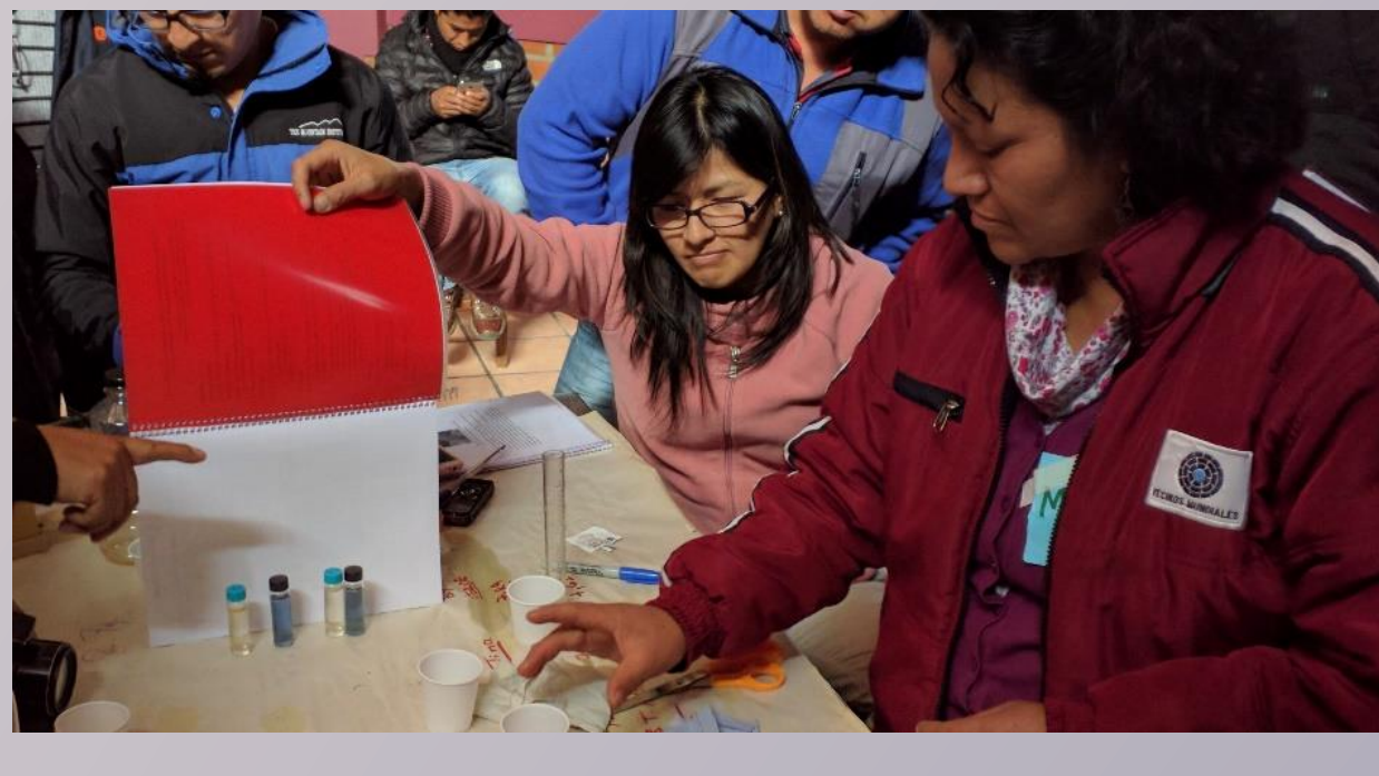
Assessing soil-available phosphorus, Andes training 2017