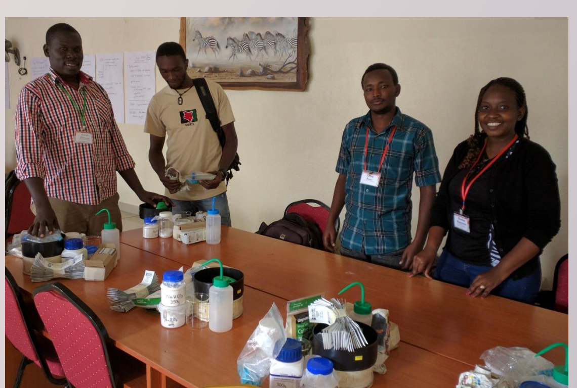
Soil tool kits going to East Africa partners, May 2017